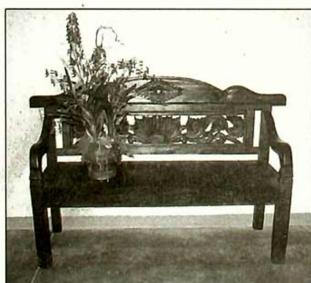
Hand Carved Teak Bench and Silk Arrangement

Park City's Home Furnishing Warehouse UNIQUE AND ONE OF A KIND GIFT IDEAS!